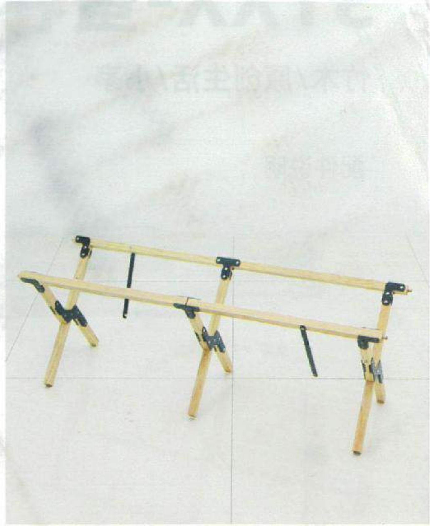
2. Continue to open the table legs as shown in the picture