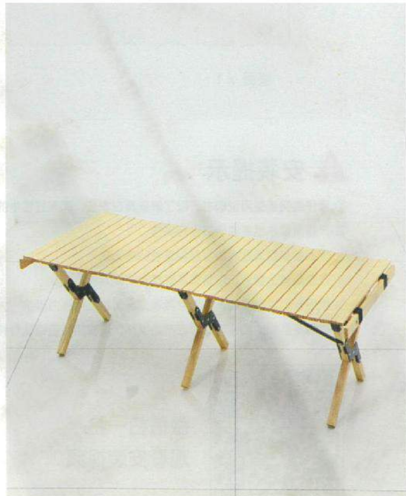
4. Take out both ends of the tabletop and insert them into the table legs.