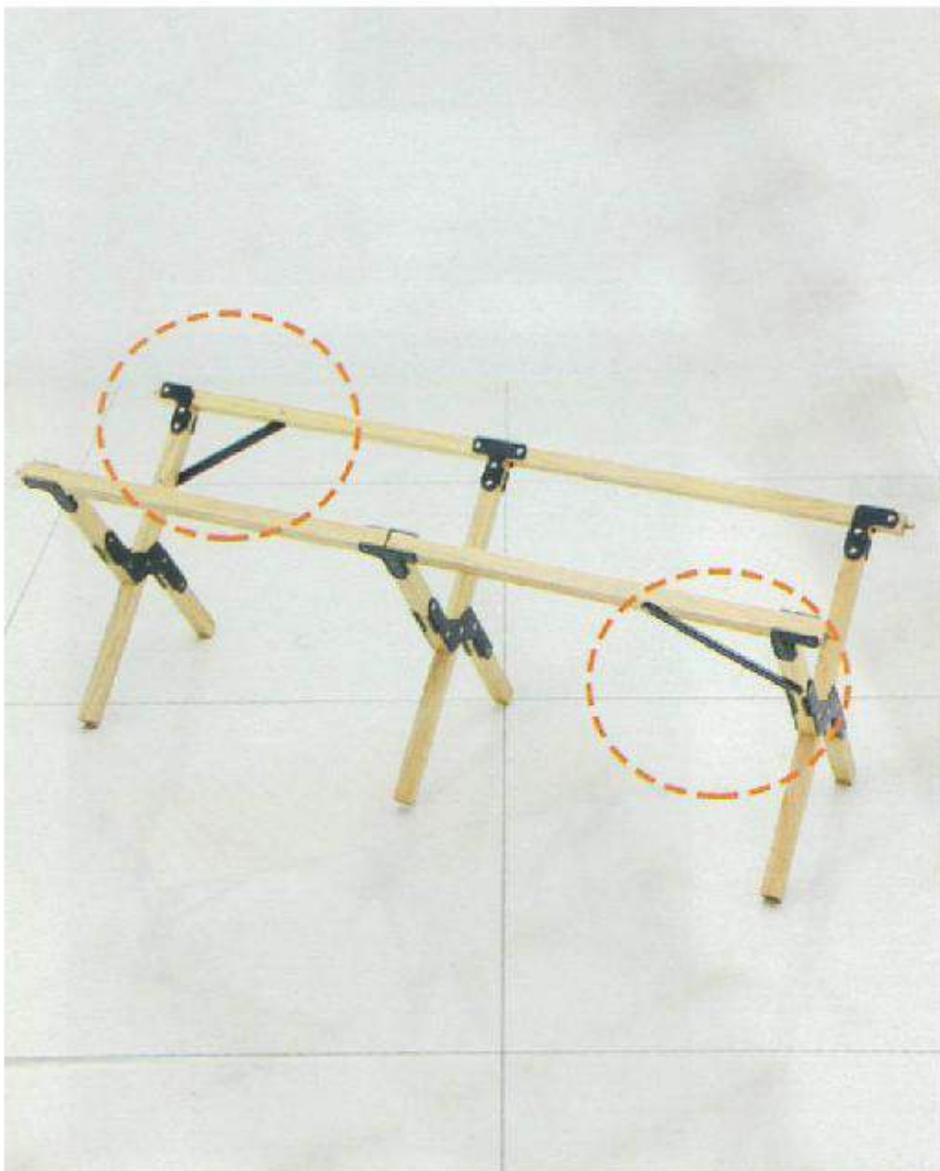
3. Hook the table legs